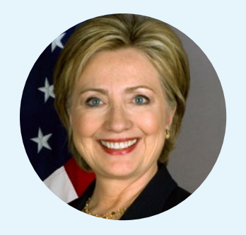
Hillary Rodham Clinton Former Secretary of State, United States